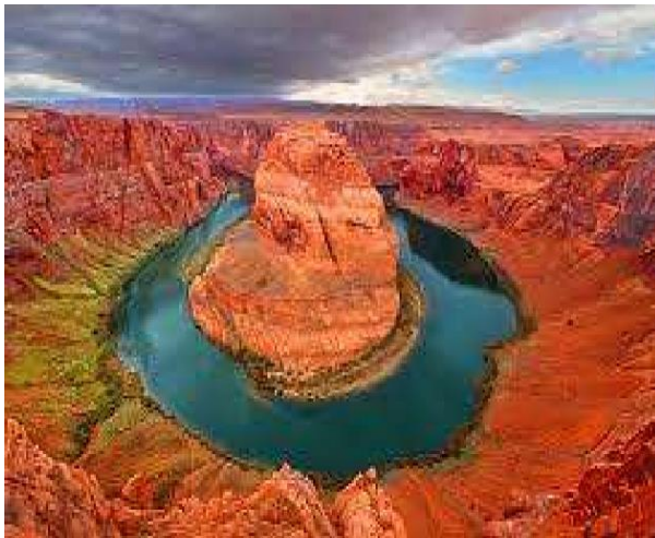
See Horseshoe Bend