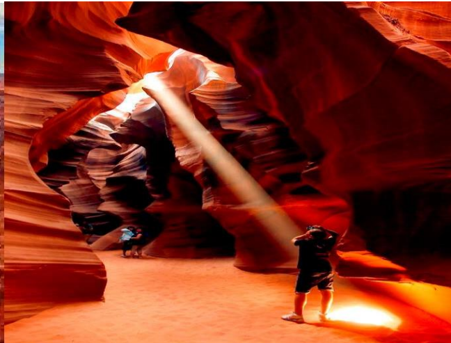
Explore Antelope Canyon