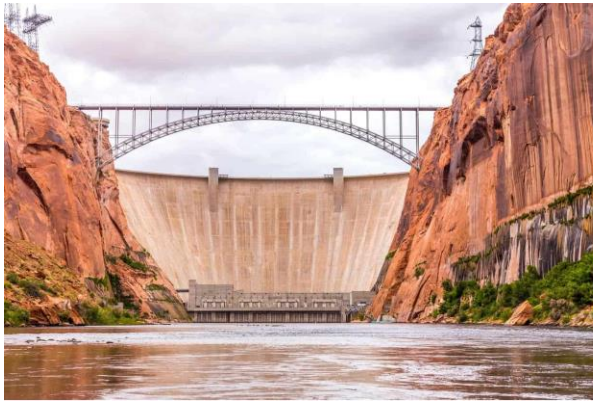
Visit Glen Canyon Dam

Lake Powell: Lake Powell is a major vacation spot that around two million people visit every year. The long and winding Lake Powell is known for its scenic beauty and recreational opportunities including houseboating, swimming, scuba diving, snorkeling, boating, water skiing and jet skiing. You can rent Jet Skis / boats and have a blast for the day.