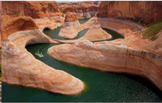
Rent jet skis at Lake Powell